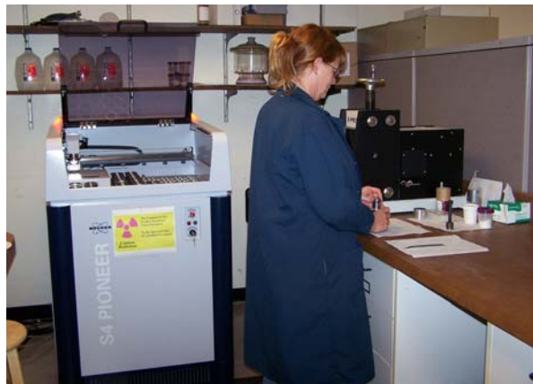
One of Bowser-Morner’s skilled technicians carefully prepares the samples as needed for the precise XRF analytical testing.

As with most superheroes, there’s more to the XRF than meets the eye, of course. First, while this X-ray fluorescence (XRF) unit, shown in the photograph below, may look unassuming, it’s a giant in the sophisticated end of analytical equipment. Using XRF analytical methods, samples of a minimum size are bombarded directly by X-ray radiation, and the reflected or scattered radiation